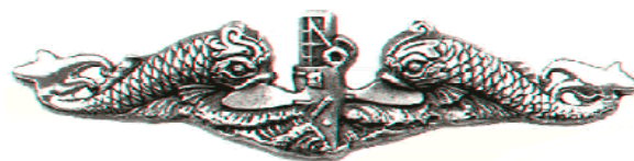
USS S-28 Memorial Dedication