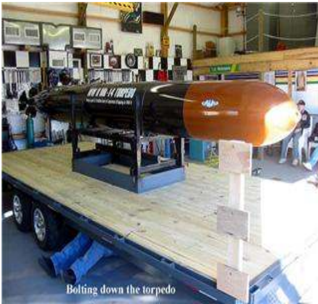
Bolting down the torpedo