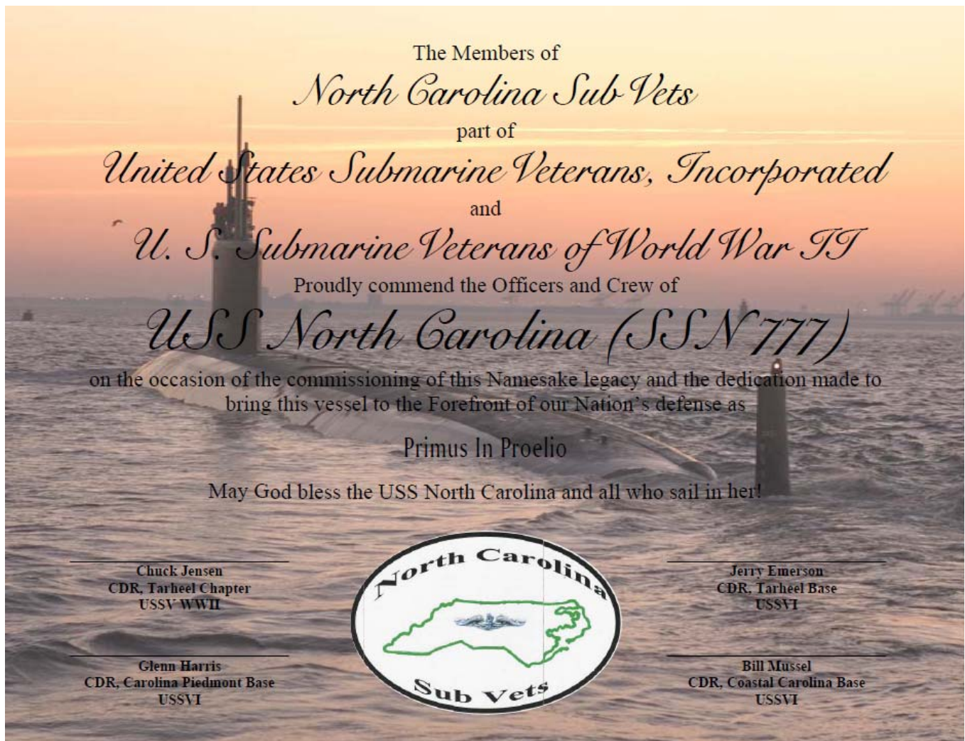
A copy of the plaque that the NC Subvets presented to the SSN-777 on 3 May