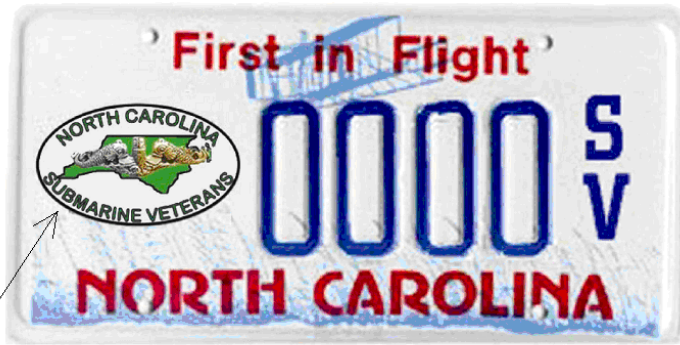
Representative Plate with Logo Options Below: