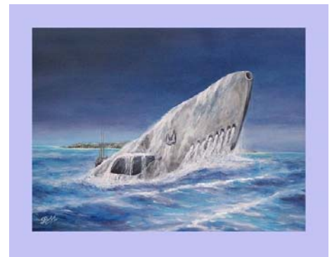
Coming Up Artist: S BURBRIDGE, www.SubArt.net (Used with permission)