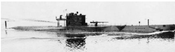
The U.S. Submarine Veterans of WWII assigned USS S-28 (SS-133) to the State of North Carolina