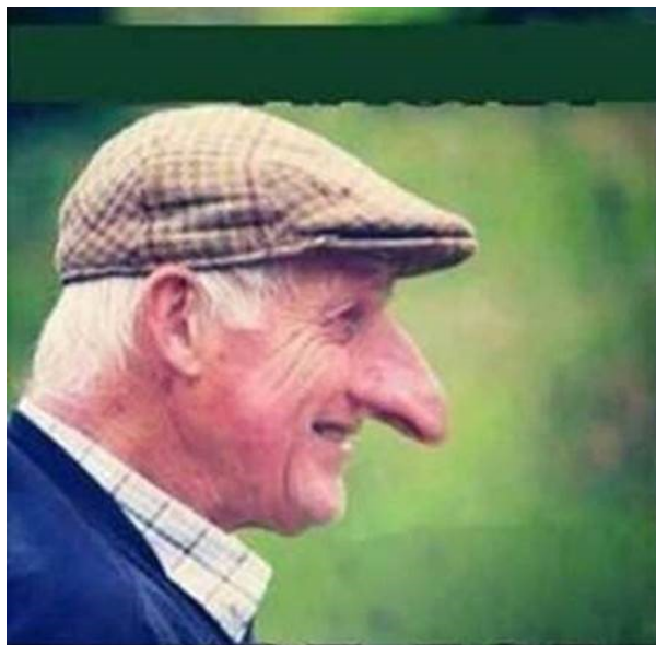
Don't snort Viagra

The "All Clear" Public Service Item of the Quarter