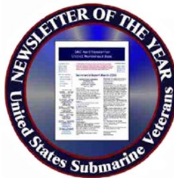
2012 National Winner Newsletter of the Year