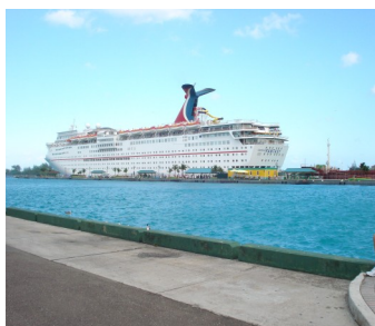
Yes, the water is that color.

I am looking at putting another cruise together and would love some input as to where you would like to go, and the time frame. Also what port would you like to leave from. Its about 525 miles to Cape Canaveral. I will be waiting for your feedback. my email is HOLLT-KIDS@aol.com and phone number 704-289-4650.