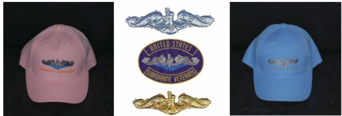
KAP(SS) 4 KID(SS)