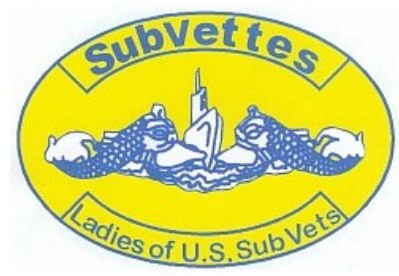
Carolina Piedmont Base Calendar of Upcoming Events