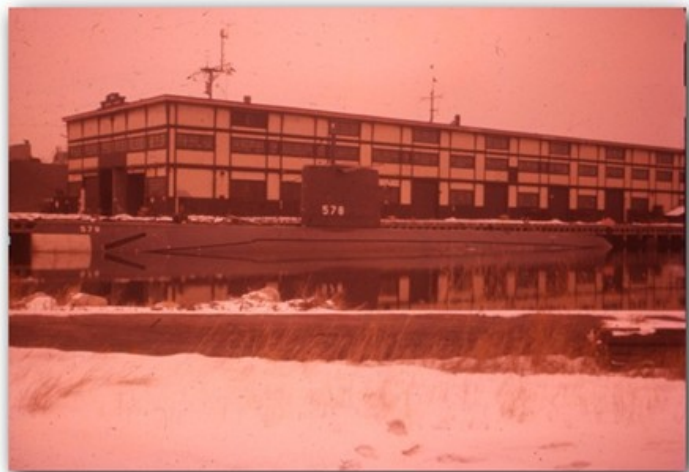
USS Skate - State Pier - Feb 1959