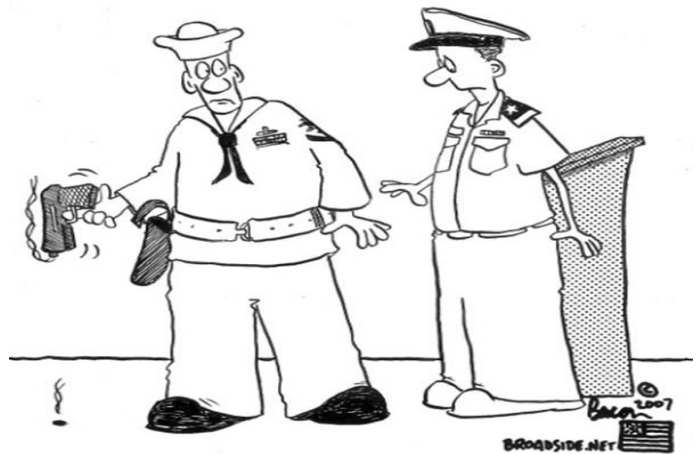
Thus ending the midwatch quick-draw competition.