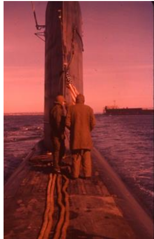
Figure 4 Skate pulling into State Pier

Wilkins, an arctic explorer, over the ice. We traveled about 3,500 miles and surfaced through the ice 15 times before returning to New London – 55 years ago, this month!