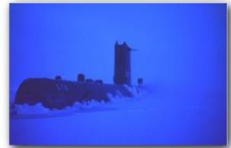
Figure 1 USS Skate SSN-578 Near the North Pole, March 1959

This is the kind of strength God is prepared to give us, in our daily lives, if we will only ask Him for it.