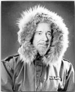
Figure 3 Sir Hubert Wilkins

On March 17, 1959 at 1054Z Skate broke through the ice at the North Pole and we stepped foot on the ice at the North Pole, from the deck of a submarine for the first time in history.