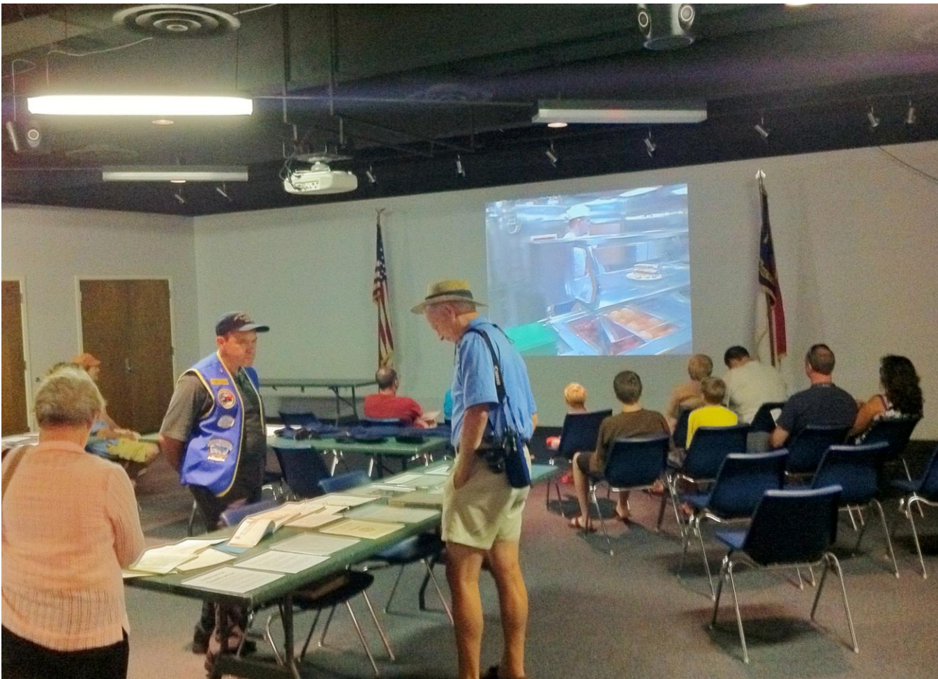
Commander Terry describing surfacing through the ice pack. Submarine life video in the background.

National Convention: The national convention for the USSVI will be held in Norfolk, Virginia from Sunday, September 2 nd to Saturday, September 8 th . Base Commander Terry reported that we now have the volunteers needed to cover the registration desk for the assigned periods. Butterbean mentioned that the meeting is setting up to be a very good meeting and encouraged attendees to register to attend if possible.