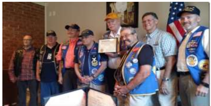
CHARTER MEMBERS OF THE OLD NORTH STATE BASE OF UNITED STATES SUBMARINE VETERANS INC.

Meets every 2nd Saturday of each month at various location as indicated in agenda