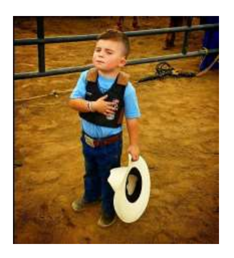
HOW IT IS DONE AT