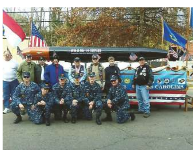
Asheville Holiday Parade