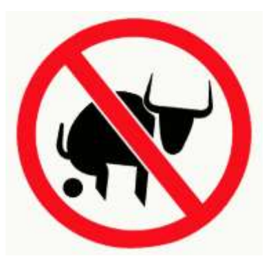
Okay, well maybe a little.