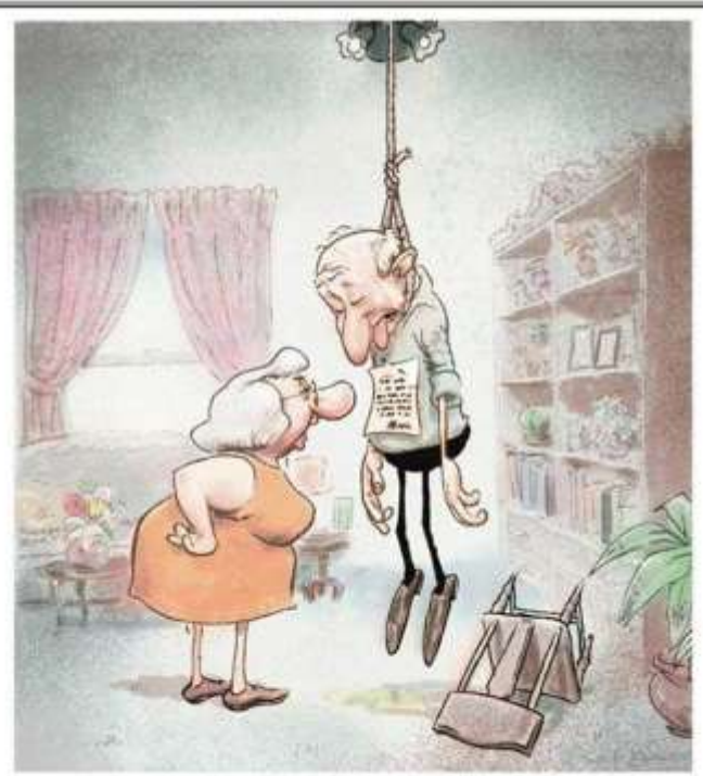
"You misspelled 'constant criticism'."