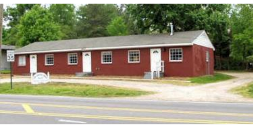
American Legion Post 67 8523 Chapel Hill Road (NC Hwy 54), Cary, NC