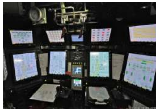
Control Room Monitors on SSN 777