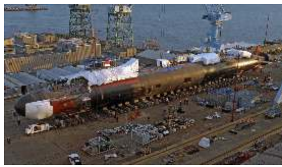
Construction in Newport News