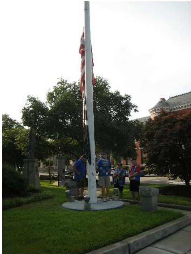
21 Day Salute to the Flag City Hall Wilmington, NC June 25, 2014

Members from the Coastal Carolina Base participated