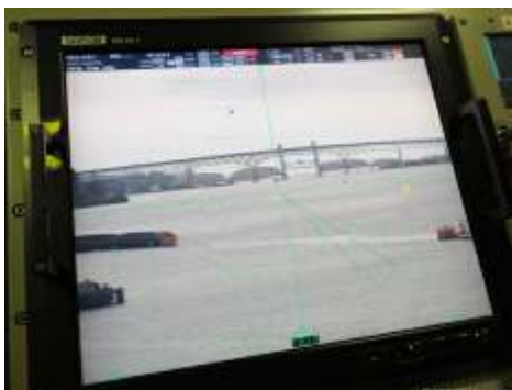
Periscope Monitor View of I 95 Bridge at New London