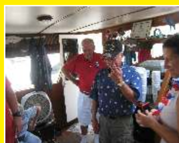
Lunch on the Fletcher's Yacht Story on page 5