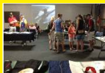
BB 55 Salute to Submarine Service Story on page 8