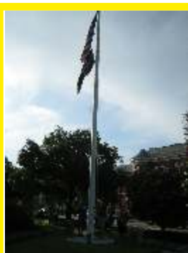
Salute to the Flag Story on page 3

The organization will engage in various projects and deeds that will bring about the perpetual remembrance of those shipmates who have given the supreme sacrifice. The organization will also endeavor to educate all third parties it comes in contact with about the services our submarine brothers performed and how their sacrifices made possible the freedom and lifestyle we enjoy today.