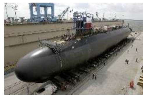
In Dry Dock