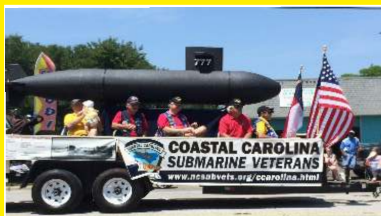
North Carolina 4 th of July Parade Story on page 4