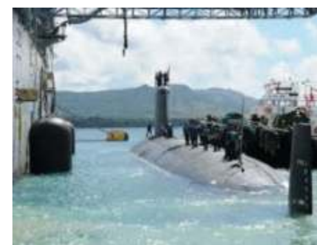
Mooring along side USS Land (AS 39) in Guam