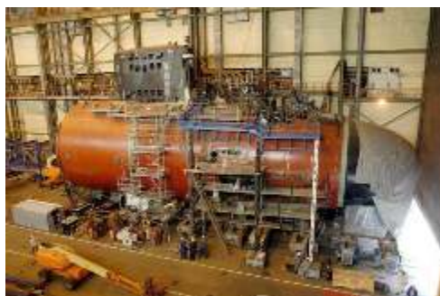
Construction in Newport News