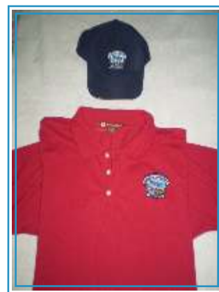
Base Gear Available