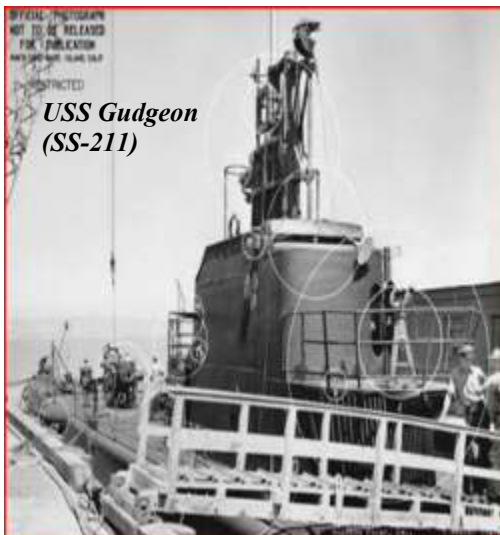
USS Gudgeon (SS-211)

On 27 January 1942, en route home, Gudgeon became the first United States Navy submarine to sink an enemy warship in World War II. Gudgeon fired three torpedoes, and I-73 was destroyed; though Gudgeon claimed only damage, the loss was confirmed by Fleet Radio Unit Pacific.