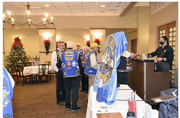
The beer and wine station. ⇨