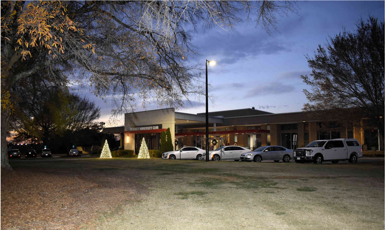
Photo of the North Carolina State University Club where the 2021 Pearl Harbor Remembrance Dinner was held.

ALL CLEAR is the award winning quarterly publication of the United States Submarine Veterans, Inc. (USSVI) sharing information from all USSVI bases in North Carolina