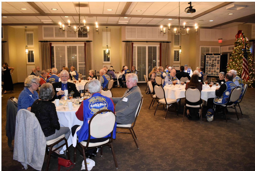
Over 80 submarine veterans, wives and guests attended the 2021 Pearl Harbor Remembrance Dinner.

More photos can be viewed in the YouTube video link below.