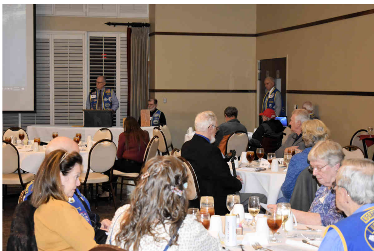
Towards the end of the dinner a brief Tarheel Base Meeting was held and awards handed out.