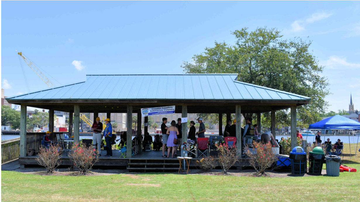
Enjoying great lunch were 66 subvets, family members and guests at the WWII Veterans Pavilion.