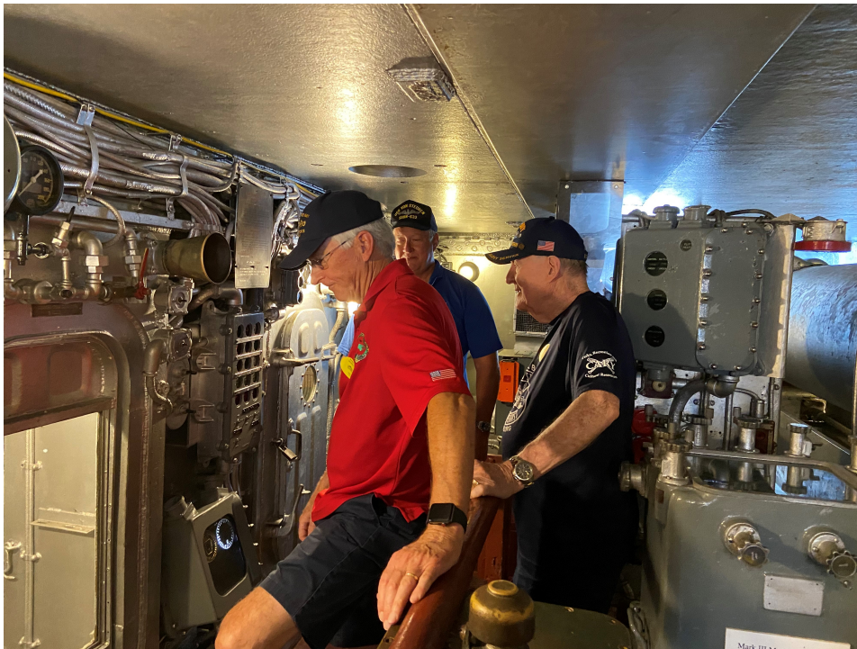
Subvet's from Old North State and Tarheel Bases came early for tours of the North Carolina BB-55. They had great tour guides who, in this case, explained how the BB-55 computers guided the cannons with such accuracy.