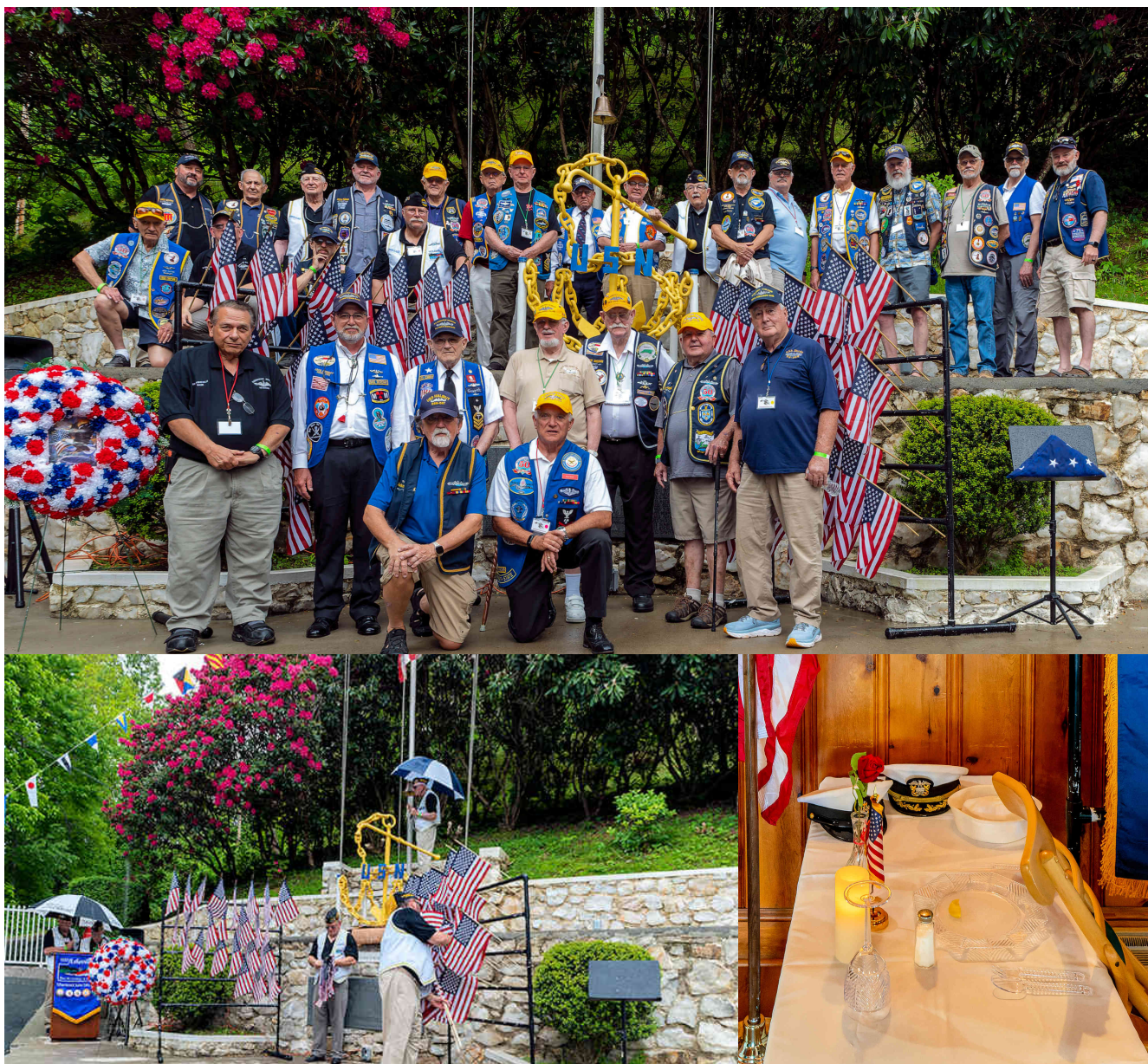
Photos of the NC SubVets at the 2022 Moonshine Memorial Weekend

ALL CLEAR is the award winning quarterly publication of the United States Submarine Veterans, Inc. (USSVI) sharing information from all USSVI bases in North Carolina