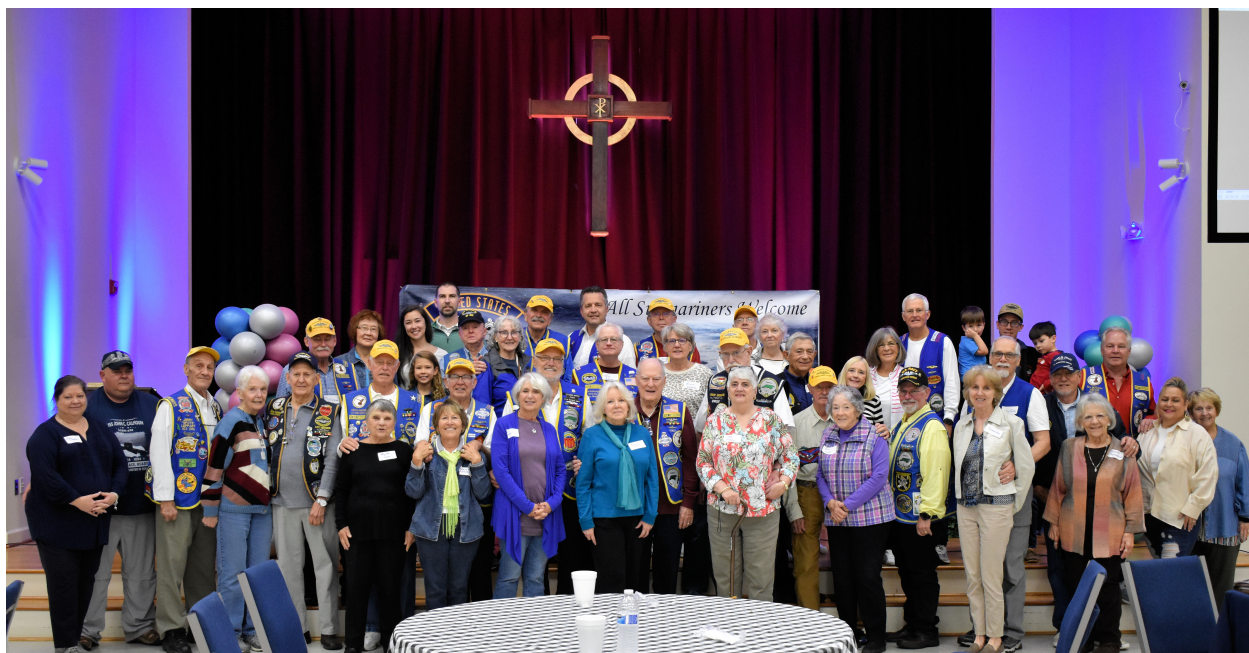
Group shot with almost everyone!