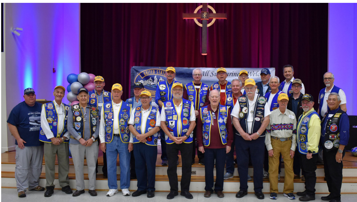
Tarheel Base members