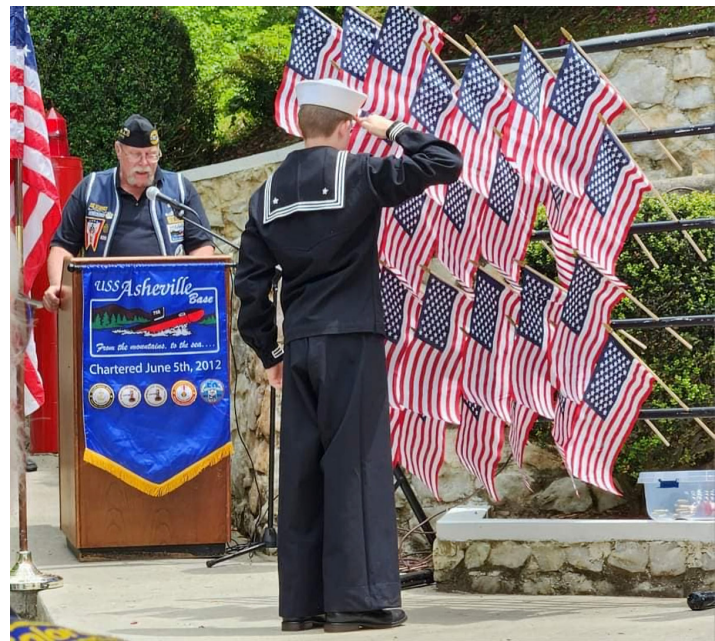
Local Sea Cadets did a fine job during the memorial service.