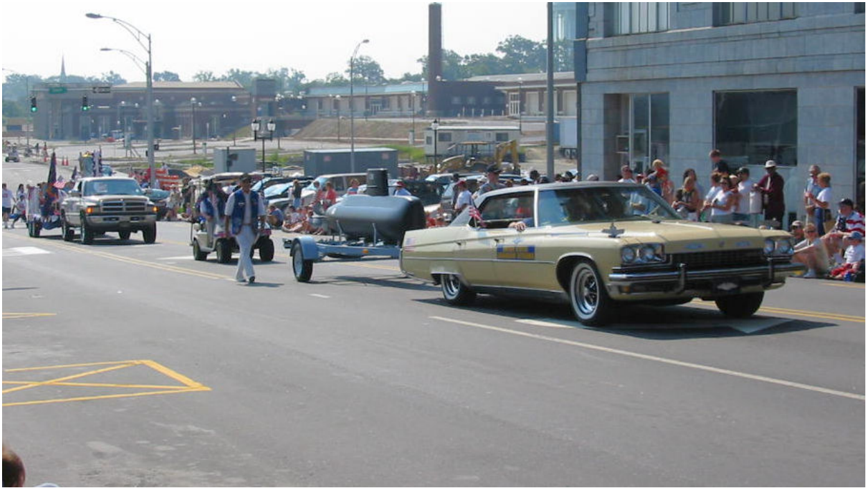
Tarheel Base SubVets escort the new float in the Greensboro