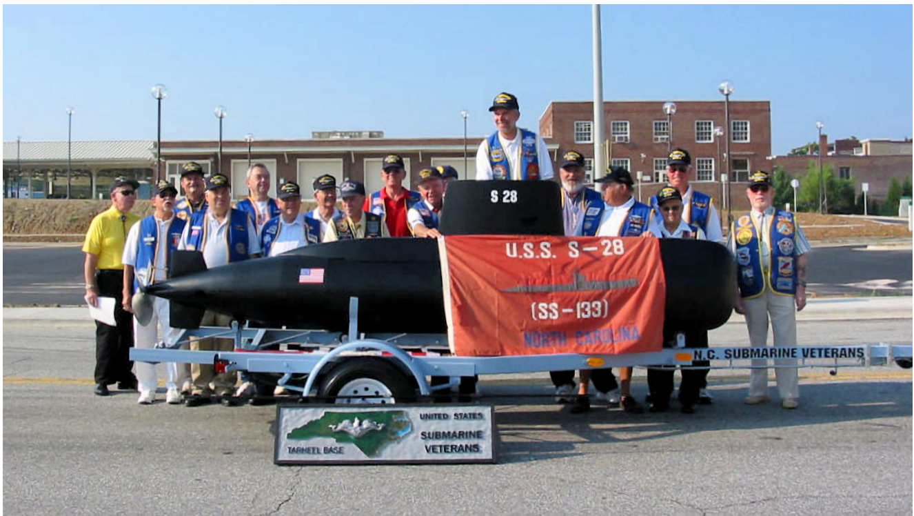
S-28 at Greensboro Parade 2003

North Carolina Submarine Veterans float commissioned 2003 has come out of mothballs to be USS Asheville Base's new float. Pictured are Tarheel Base members and the float in Greensboro for the Fun Fourth Festival Parade.