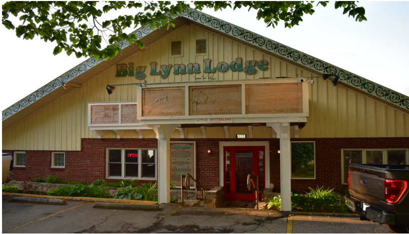
Located between Spruce Pine and Little Switzerland of Hwy 221A, Big Lynn Lodge was host for the Moonshine Mountain Memorial 2023.