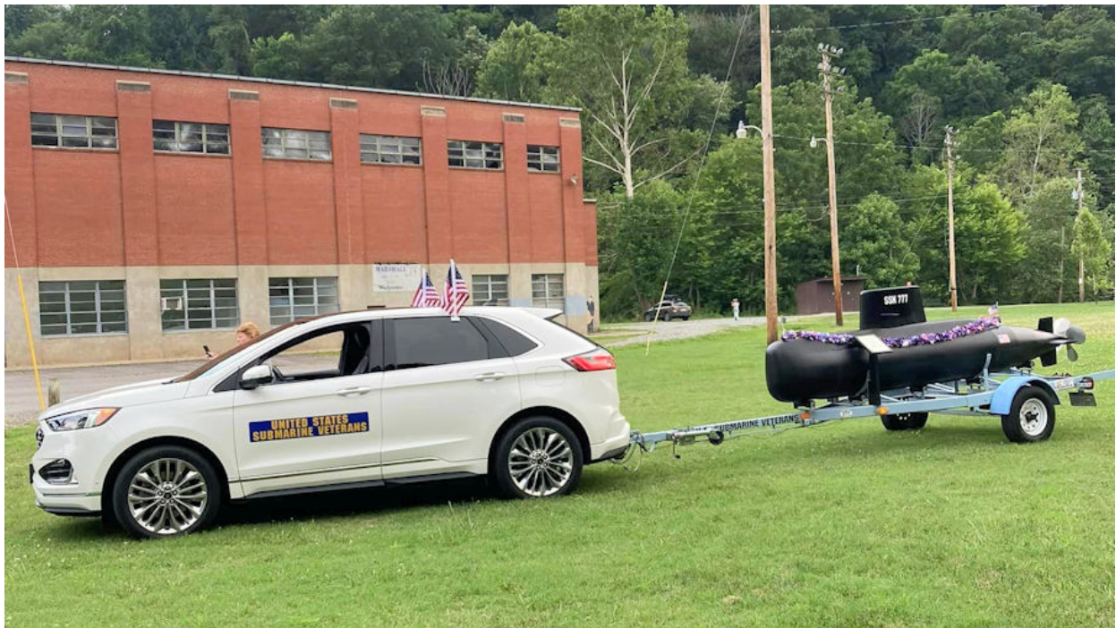
Twenty years later USS Asheville Base shows her off in the 2023 Marshall 4 th of July parade.